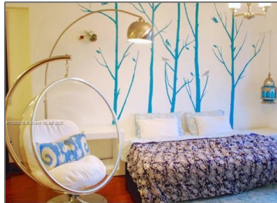
Sofa queen bed.